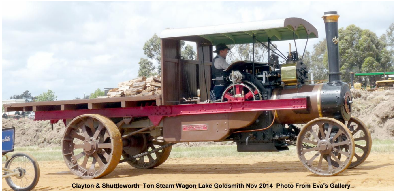
Clayton & Shuttleworth Ton Steam Wagon Lake Goldsmith Nov 2014

Steam is still the backbone of Lake Goldsmith Rally's. These Foden Sentenal and Clayton wagons