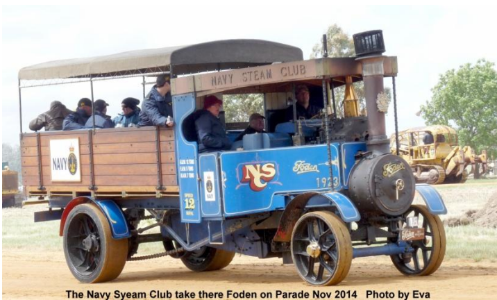
The Navy Steam Club take there Foden on Parade Nov 2014