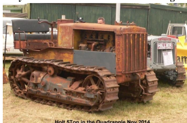
Holt 5Ton in the Quadrangle Nov 2014