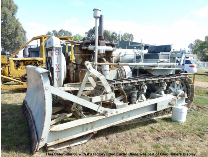
This Caterpillar 60 with it's factory fitted Euclid Blade was part of Greg Hilliers Display.

Greg Hillier brought the Caterpillar 10, which replaced the 2 Ton and a 15 from Corryong and Bob Addison's Transition Model 60 left the factory with Best and Caterpillar embossed parts in 1925. This Tractor's home is Beaufort where it stays with Bobs comprehensive Caterpillar collection.