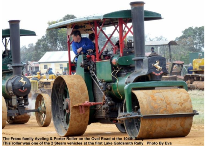
The Franc family Aveling & Porter Roller on the Oval Road at the 104th Rally. This roller was one of the 2 Steam vehicles at the first Lake Goldsmith Rally