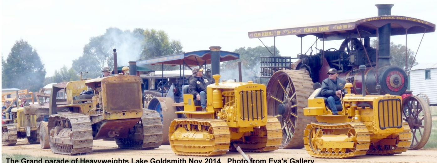
The Grand parade of Heavyweights Lake Goldsmith Nov 2014

Howard Hillerman's Tractors from Balranald in NSW head up the Caterpillar parade line