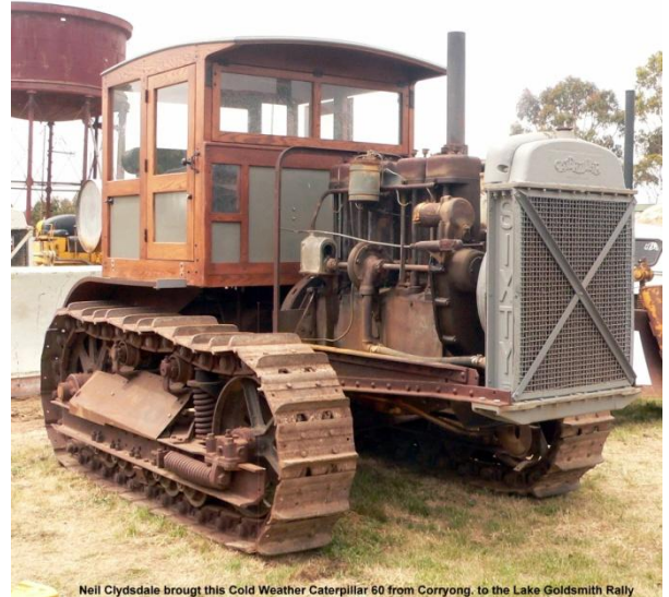
Neil Clydsdale brought this Cold Weather Caterpillar 60 from Corryong, to the Lake Goldsmith Rally

More from Corryong, this Caterpillar 60 was factory fitted with a Euclid blade, and the cold weather cab was built in the USA and is a copy of the original design using traditional US timber materials.