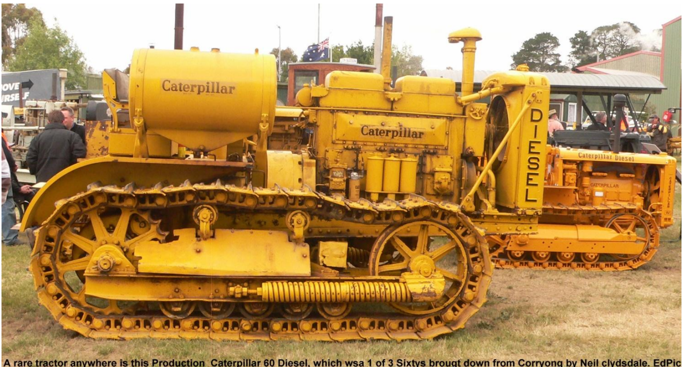
A rare tractor anywhere is this Production Caterpillar 60 Diesel, which was 1 of 3 Sixtys brought down from Corryong by Neil Clydsdale.

More from Corryong, this Caterpillar 60 was factory fitted with a Euclid blade, and the cold weather cab was built in the USA and is a copy of the original design using traditional US timber materials.