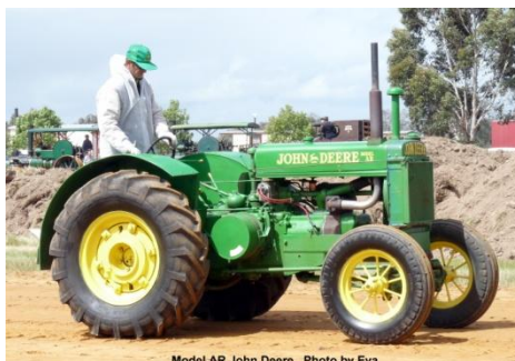
Model AR John Deere