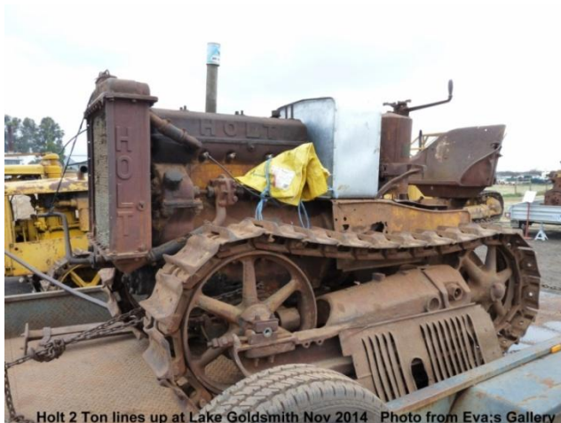
Holt 2 Ton lines up at Lake Goldsmith Nov 2014