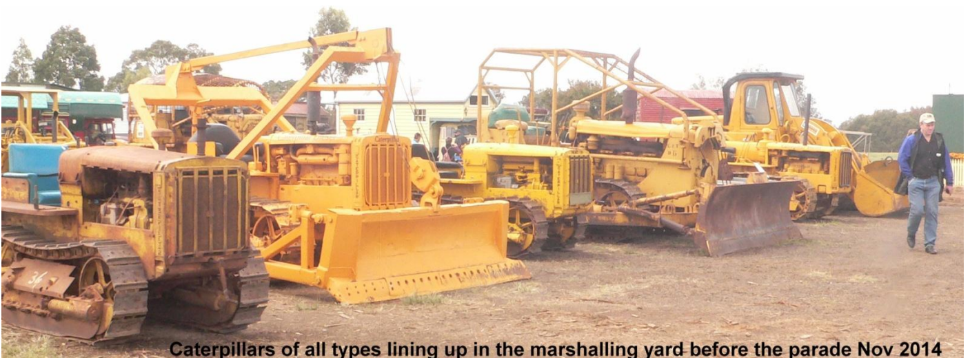
Caterpillars of all types lining up in the marshalling yard before the parade Nov 2014

quadrangle the Caterpillar marshalling areas were filled with a variety of vintage tractors.