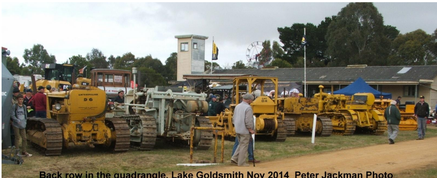
Back row in the quadrangle. Lake Goldsmith Nov 2014

The quadrangle looking South was filled with yellow and traditional gray, and looking North the wall of Graders included a 1935 Auto Patrol and a 12 grader and the Pyrenees Shire's latest machine