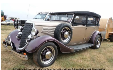
C 1934 Ford Convertible with Tear Drop Van behind at Lake Goldsmith Nov 2014.