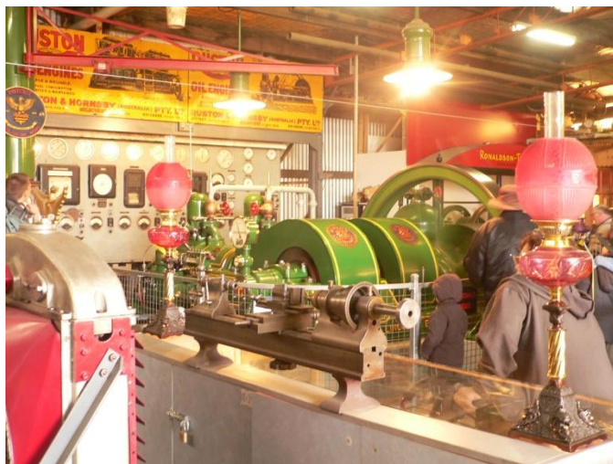
Inside the sheds this Marshall Britannia was one of many engines working in the Britannia Shed and The twin cylinder Ruston in Phoenix shed fits well with the printing press and engine displays.