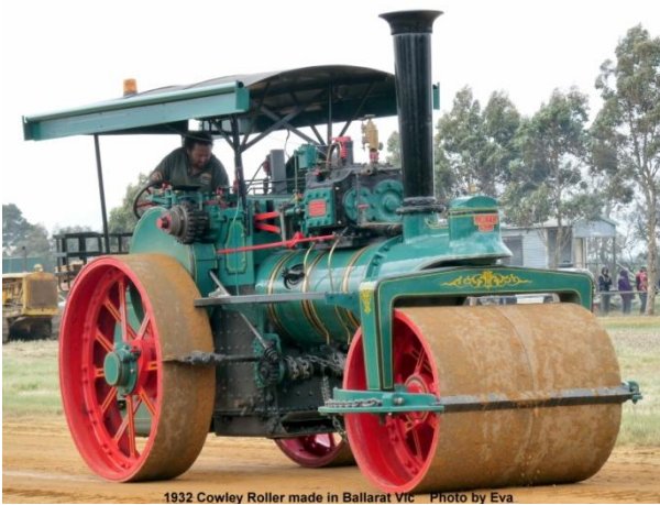
1932 Cowley Roller made in Ballarat Vic