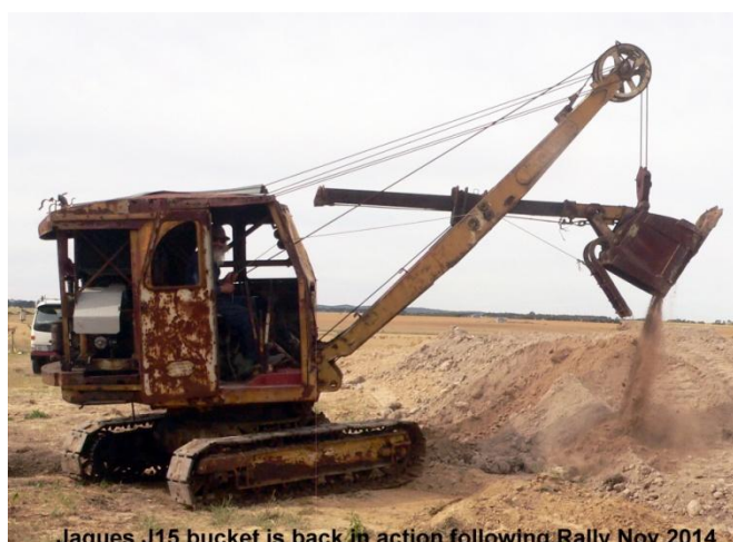
Jaques J15 bucket is back in action following Rally Nov 2014

Eva, who supplied many of the photo's in this and other issues snapped these inside