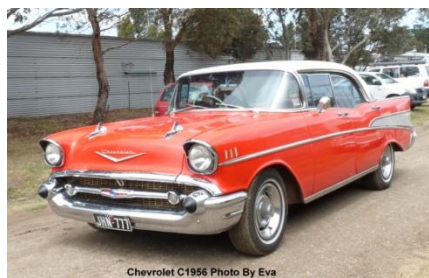
Chevrolet C1956