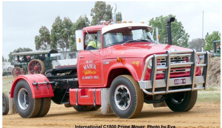
International C1800 Prime Mover

This Farmall Tractor complete with cultivating tolls and the C1800 Prime Mover looked new. There