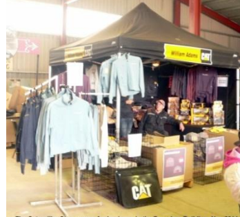
The Caterpillar Store opens for business in the Founders Building Nov 2014