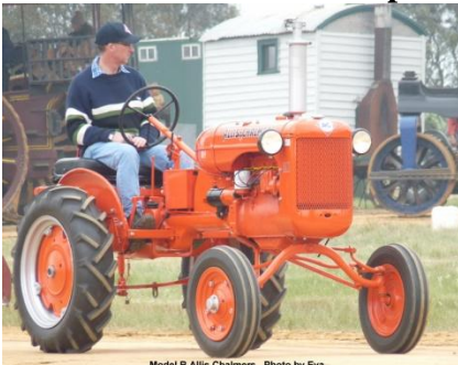
Model B Allis Chalmers

This Farmall Tractor complete with cultivating tolls and the C1800 Prime Mover looked new. There