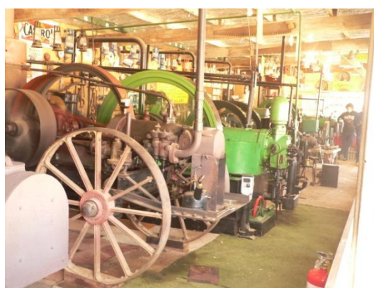
manner of specialised machinery from leather work to fuel supply equipment and blacksmithing.