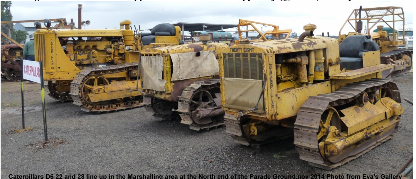
Caterpillars D6 22 and 28 line up in the Marshalling area at the North end of the Parade Ground.nov 2014

This caged D7 with blade and rippers seemed like an unstoppable juggernaut, and beyond the