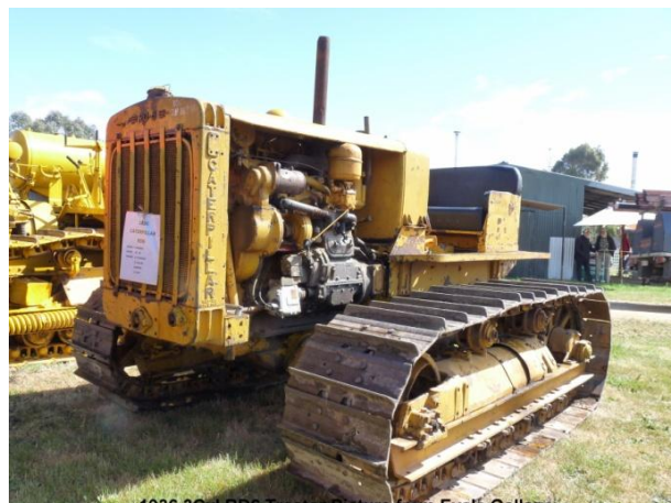
1936 3Cv1 RD6 Tractor