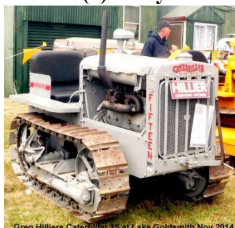
Greg Hillier's Caterpillar 15 at Lake Goldsmith Nov 2014