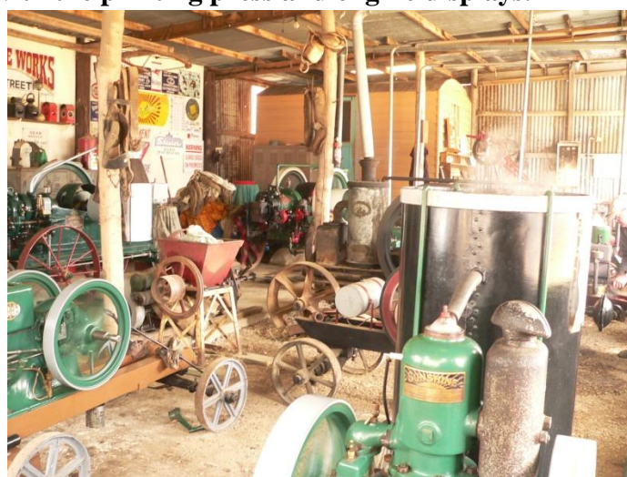
Many sheds had displays of working and stationary and portable I.C.E and Steam engines amidst all