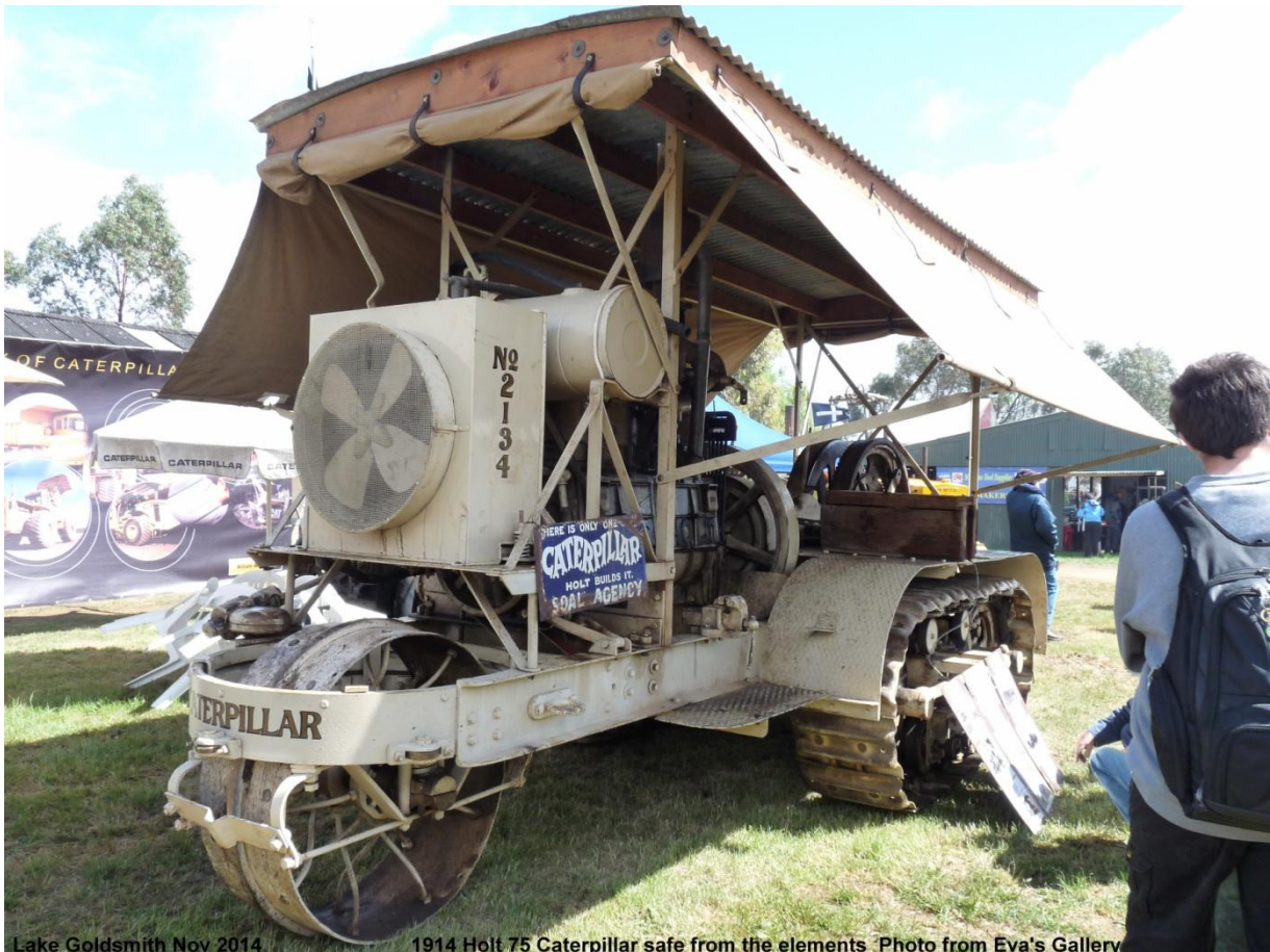
Lake Goldsmith Nov 2014 1914 Holt 75 Caterpillar safe from the elements