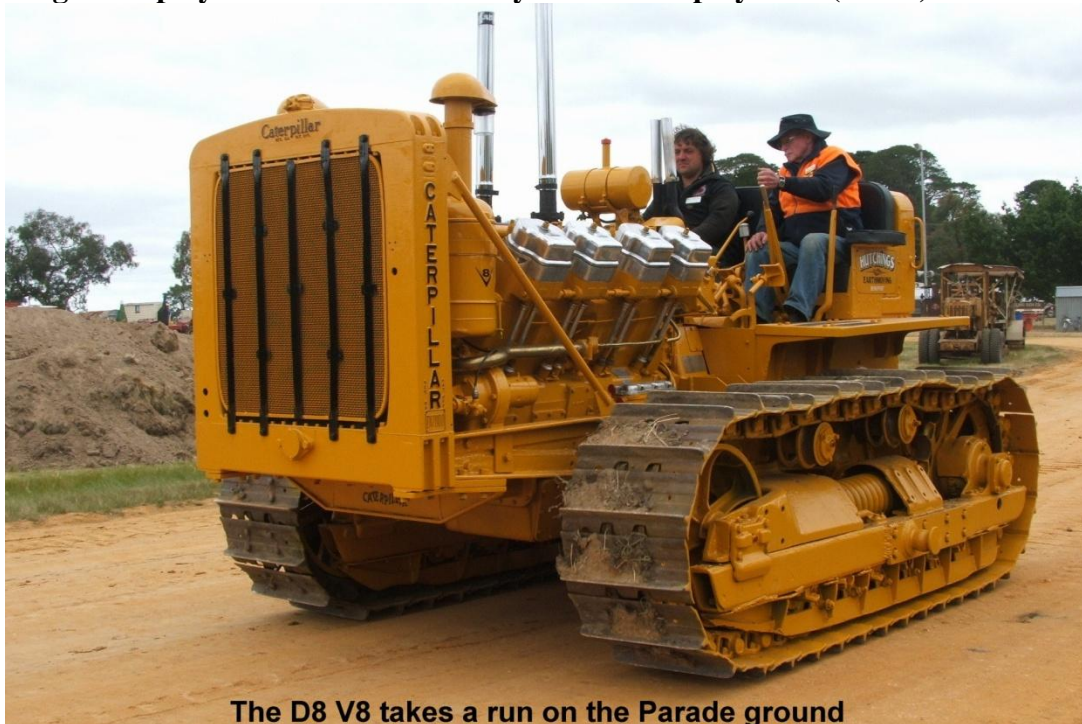
The D8 V8 takes a run on the Parade ground

Melbourne Steam Traction Engine Club displayed their D4 Cutaway Motor (No. CM006) This D-135 engine is one of a series of factory prepared sectioned motors used for display and demonstration It was the first engine displayed in the clubs recently finished display shed (No 79) and looked a treat.