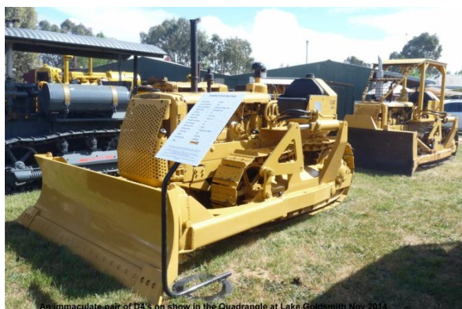
An immaculate pair of D4's on show in the Quadrangle at Lake Goldsmith Nov 2014