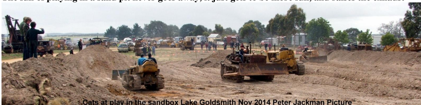
Cats at play in the sandbox Lake Goldsmith Nov 2014

The fun of playing in a sand pit never goes away, it just gets to be more fun, and raises the exhaust