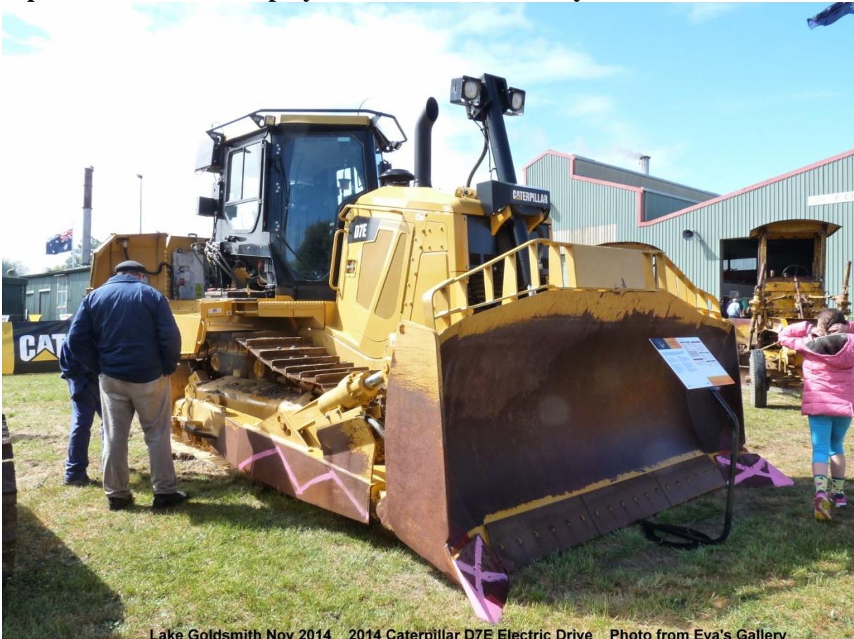
Lake Goldsmith Nov 2014 2014 Caterpillar D7E Electric Drive