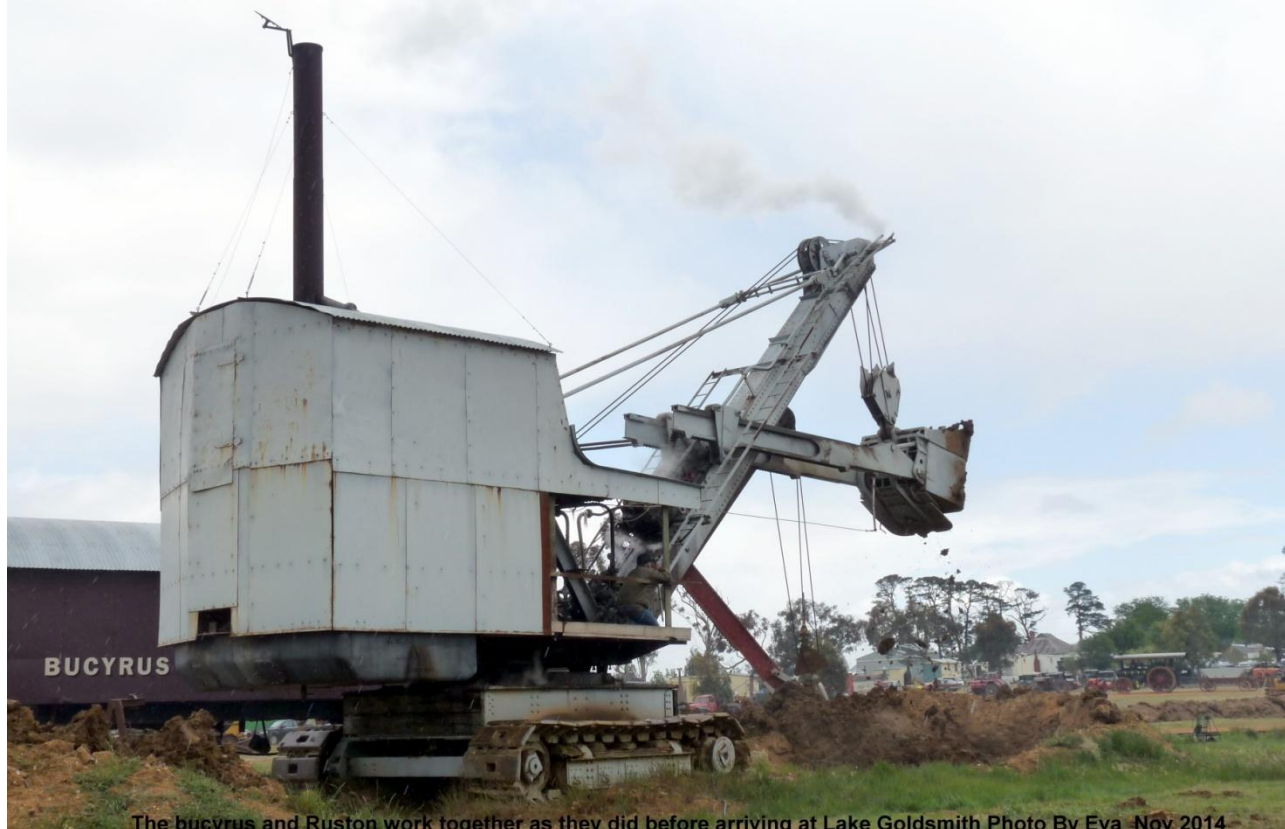
The bucyrus and Ruston work together as they did before arriving at Lake Goldsmith

The Caterpillars and the earthworks were like a Rally within a Rally. The Goldsmith Steam Rally went on as usual and everything merged into a great event that was enjoyed by all. The Ruston and Bucyrus Steam Face Shovels added to the earthworks