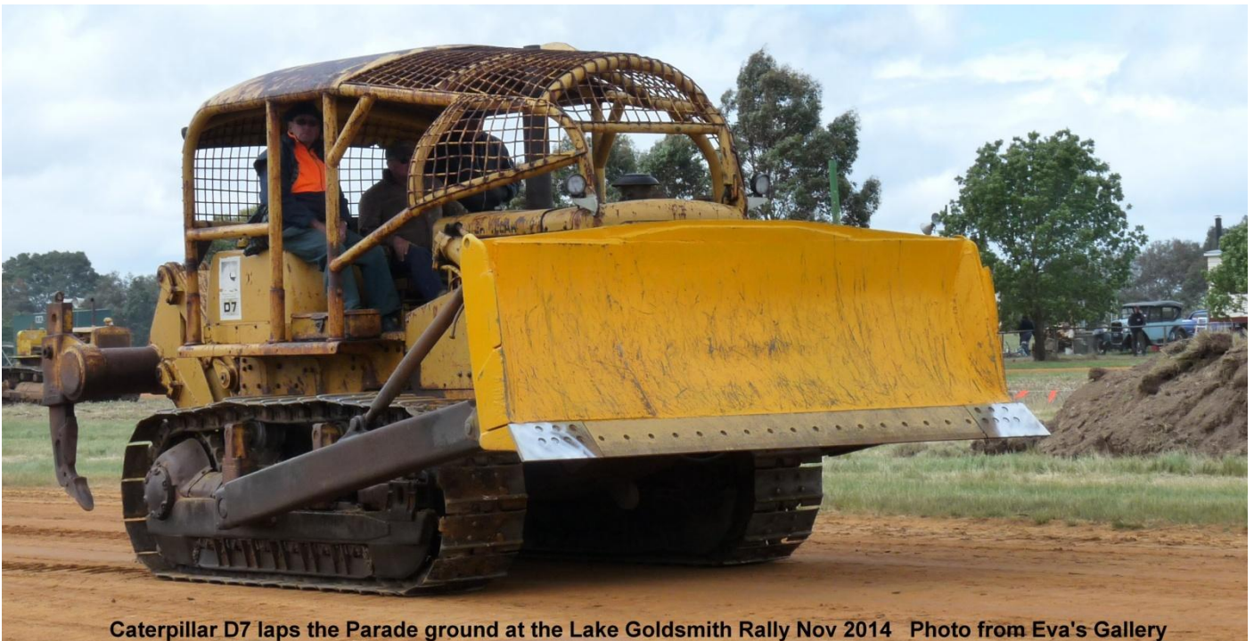
Caterpillar D7 laps the Parade ground at the Lake Goldsmith Rally Nov 2014

This caged D7 with blade and rippers seemed like an unstoppable juggernaut, and beyond the